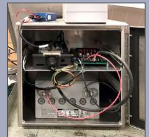
Competitor's control box.