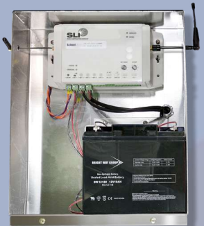
A clean solar traffic control box means easy repairs when needed

Solar Lighting International, Inc. will also custom-design a school zone warning solution to meet any specifications.