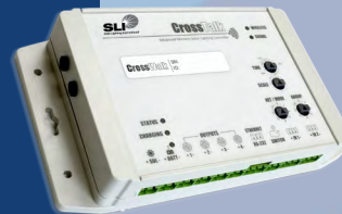
CrossTalk Advanced Lighting Controller