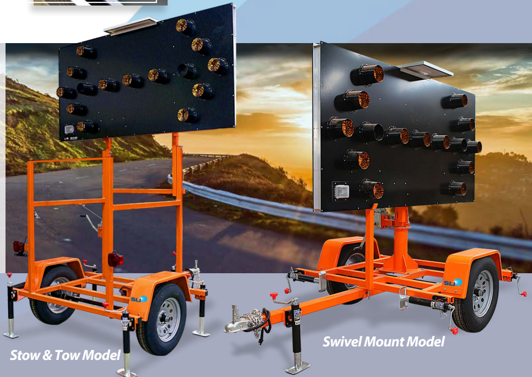
Stow & Tow Model