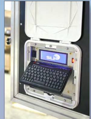
SLI's on-board controller