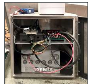
Competitor's control box.