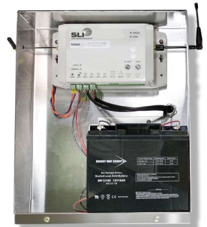
Clean designed control box means simple repairs

Solar Lighting International, Inc. will be happy to custom design a system to meet your specifications.